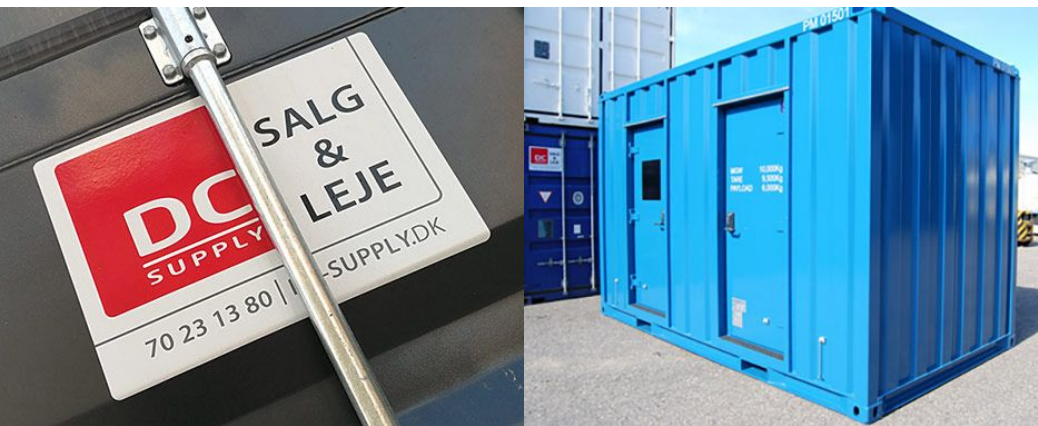
10 fods standard stålcontainer

Available as both used and new - new containers can be delivered with a personalised logo.